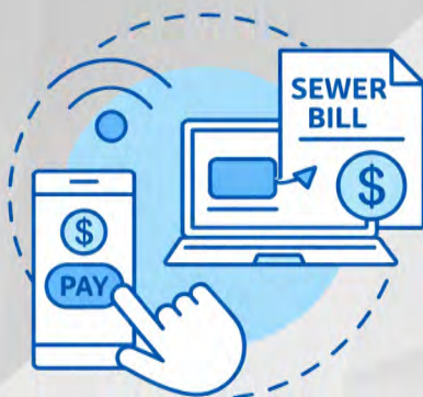
Online bill pay

Simply update the payee name to West Branch by April 1st .